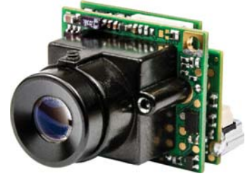
Shown with optional lens