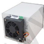
L-NSARK-PI L-NSARK-PI Pre- Installed SATA Box