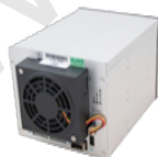
L-NSAARRK L-NSAARRK 2nd SATA Back Box