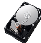
IN2TB-UG IN2TB-UG Upgrade 1st Internal drive to 2TB hard drive (from 1TB)