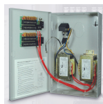
EA24A12-P18 EA24A12-P18 Power Supplies