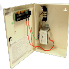
EA24A6-P9 EA24A6-P9 Power Supplies