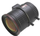
HV3816D-8MPIR 3.8~16mm DC Iris Lens