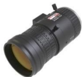
HV1140D-8MPIR 11~40mm DC Iris Lens