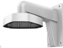
DS-1273ZJ-DM25 Wall Mount