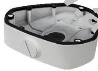
DS-1281ZJ-DM25 Inclined Ceiling Mount