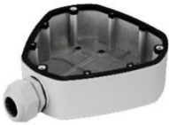
DS-1280ZJ-DM25 Junction Box