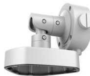
DS-1283ZJ Wall Mount (3-axis Adjustment)