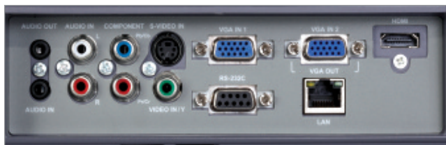
Includes a full complement of connections, including network control.

EIKI® is a registered trademark of EIKI International, Inc. Kensington® is a registered trademark of ACCO Brands Corporation.