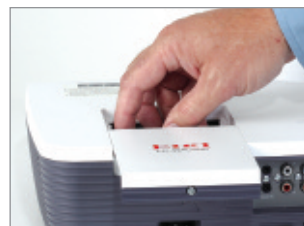
Easy to change long-life lamp.