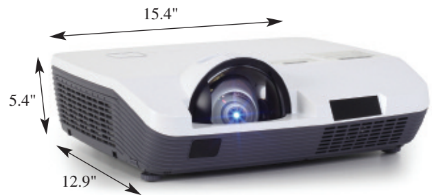
LC-WAU200 • WXGA projector.