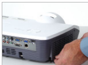
Handy access to air filter.