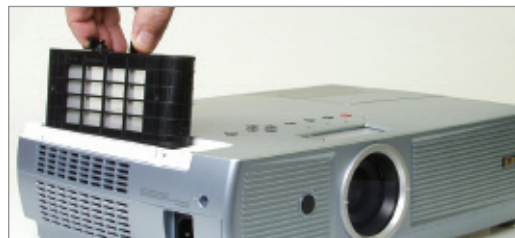
Replaceable air filter cartridge.