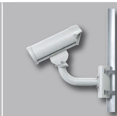
Optional sunshield (Model SS-1) for high temperature environments