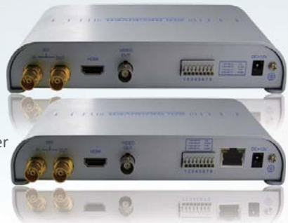
SSD-RX010N SDI IP Receiver without PoC