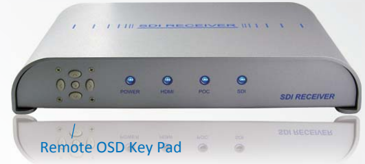
SSD-RX010 SDI Receiver without PoC