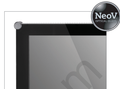
NeoV™ Optical Glass for hard glass protection and strong metal casing for secure mounting