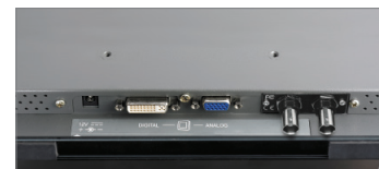
Looping BNC video connector for multiple display connections