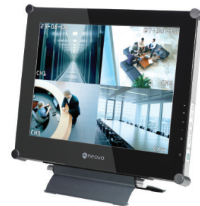
Specifically designed and tested for commercial video security applications