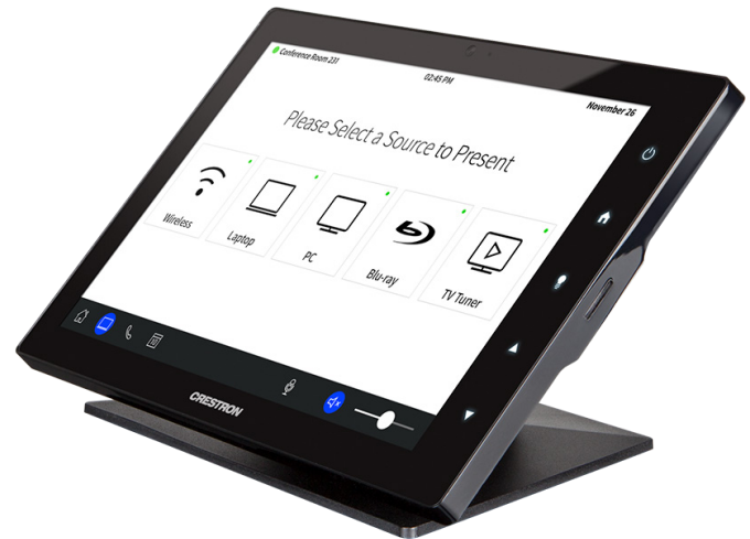
TSW-1060-NC-B-S with TSW-1060-TTK-B-S Tabletop Kit

Crestron Smart Graphics offers these enhancements and more: