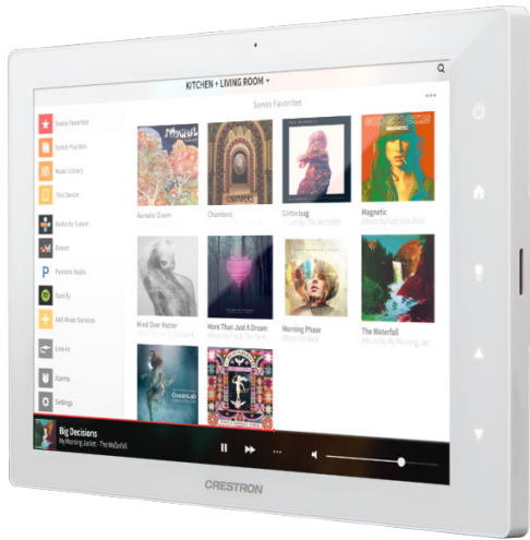
TSW-1060-NC-W-S – Shown in White