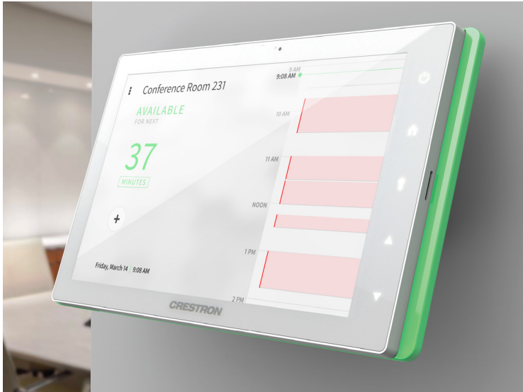
Shown in Room Scheduling mode with optional Light Bar and Multi-Surface Mount Kit

room for any available time slot. If that room isn't available when you want it, the touch screen can find you another available room nearby. Additional optional functions include the abilities to check into a scheduled meeting, extend a meeting, end a meeting early, toggle between two languages, or limit access to various functions using PIN code authorization.