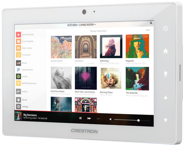
TSW-760-W-S – Shown in White