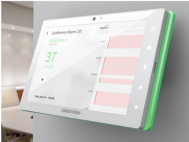
Shown in Room Scheduling mode with optional Light Bar and Multi-Surface Mount Kit

Sonos wireless speakers or a Crestron Sonnex® Multiroom Audio System . The Sonos app runs natively on the TSW-760, enabling enhanced control of Sonos products as part of a complete Crestron system. The app checks for updates nightly so it's always current. [1]