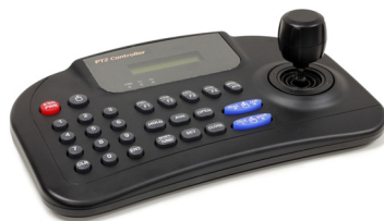
VS-TKC-100 PTZ Keyboard Controller

Features, specifications, pricing, and dimensions are subject to change without notice. Physical appearance of products may vary slightly from images shown on this document. Please visit our website for updates and information.